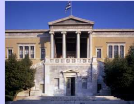
FIG Commission 3 (2007-2010) FIG Vice President (2011-2014)