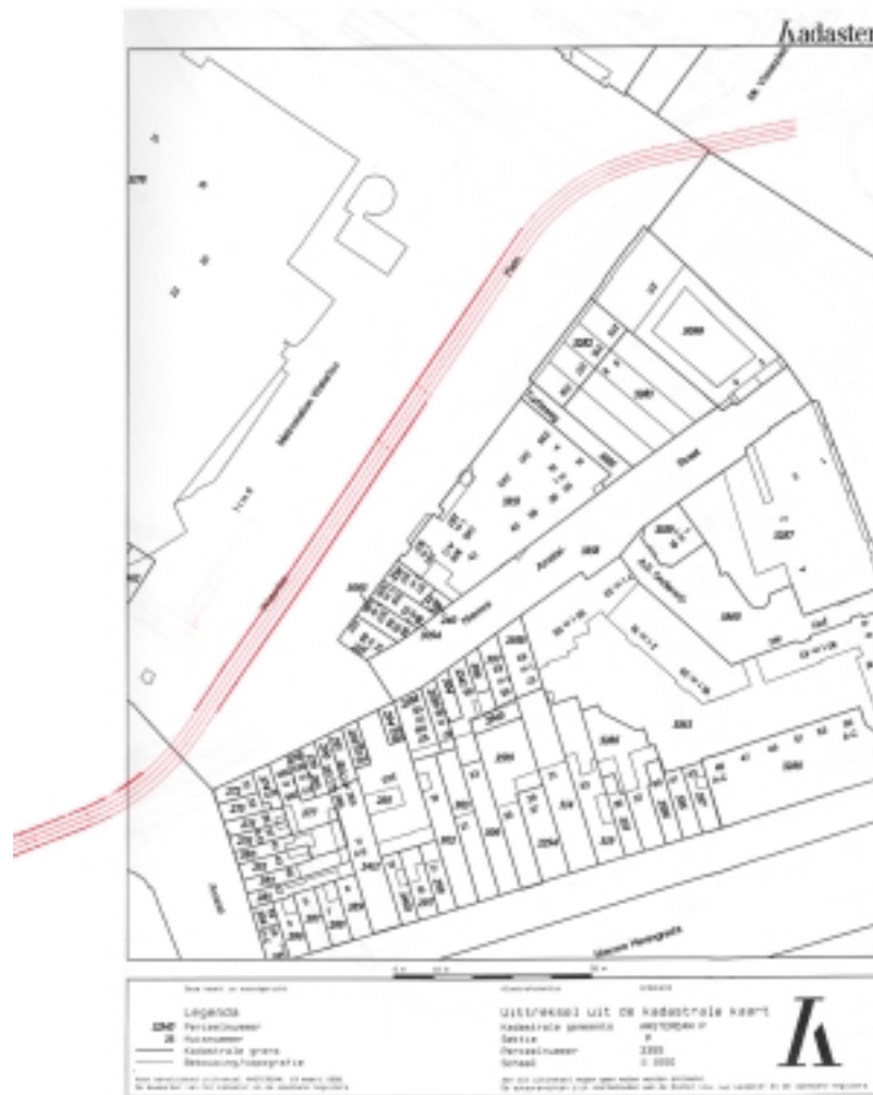
Figure 1: The cadastral map on the location of the metro in Amsterdam: the metro, which is drawn on top of the map, is not visible on the cadastral map

perspective. We then compare our approach with the findings of the workshop on 3D cadastres and end with conclusions.