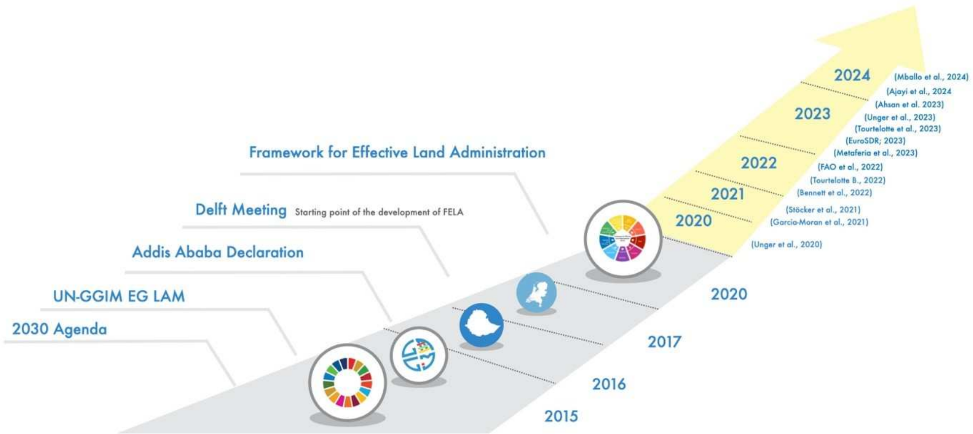
FELA Application and Research Timeline

Your World, Our World: Resilient Environment and Sustainable Resource Management for All