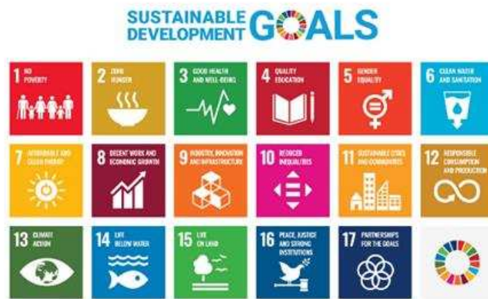
Figure 1: The United Nations Sustainable Development Goals. (United Nations, 2015)

The United Nations (UN) established the Sustainable Development Goals (SDGs) in 2015 as a comprehensive framework of objectives aimed at solving a wide range of issues, including poverty, hunger, sickness, illiteracy, environmental degradation, and gender inequality (United Nations, 2015). These goals, which are expected to be reached by 2030, include the entire developmental spectrum, including both developing and developed countries. At their core, the SDGs represent a commitment to meeting future generations' needs while navigating the complexity of the present, assuring a delicate balance between socioeconomic advancement, social inclusion, and environmental preservation (United Nations, 2015). They represent a concerted effort to align global efforts, promoting a comprehensive approach to economic growth, community integration, and environmental conservation (United Nations, 2015). In essence, the SDGs represent a visionary commitment to global well-being and sustainability. They go beyond immediate concerns, inviting a collaborative journey towards peaceful cohabitation between humans and the environment. This academic paradigm aims to drive revolutionary change by acknowledging the interdependence of various concerns and the need to create a future that resonates with both current and future generations (United Nations, 2015).