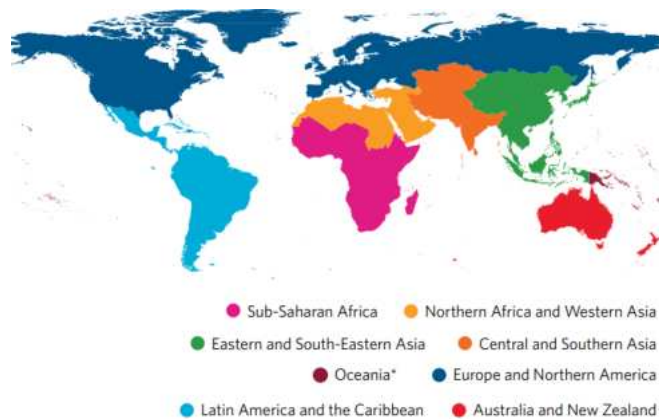
Figure 4: Regional Groupings by the United Nations (United Nations, 2023).

This multilingual landscape highlights the limitations of effectively communicating SDG 15 and other goals across multiple linguistic situations. The lack of representation of regional languages in SDG communications emphasises the need for a more inclusive approach that recognises and addresses linguistic variety to promote meaningful engagement and comprehension of the SDGs' objectives.