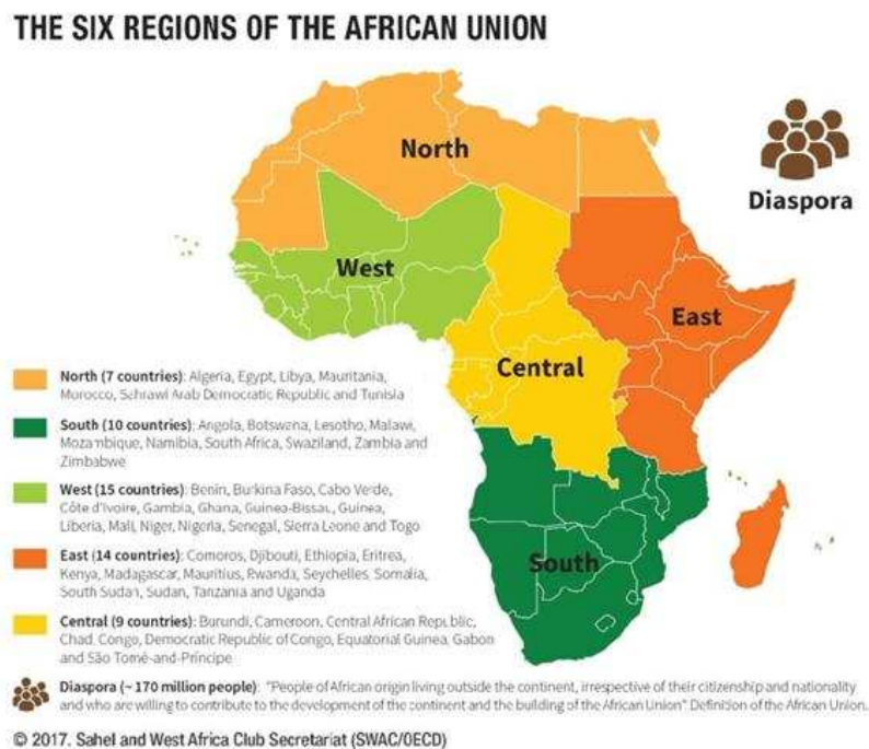
Figure 5: African Regions, (Onambele et al., 2022)

Figure 5 (Onambele et al., 2022) illustrates the African continent's regional segmentation, which provides a more detailed picture of the ecosystems and climatic diversity observed throughout many countries. This approach differs from larger categorizations in that it provides insights into the unique characteristics and challenges of specific locations, such as those connected to SDG 15. Figure 5 further shows the 10 countries that make up Southern Africa. This regional split allows for focused actions that can be adapted to each country's unique needs and contexts. Using these regional types, plans may be designed to address local ecosystems, communication patterns, and land-related challenges relevant to SDG 15 targets.