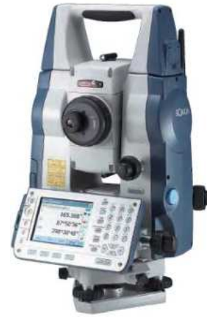
Figure 1. Measuring urban tree heights on the screen using Nearmap © oblique imagery (left) and the Sokkia Set3x reflector-less total station.