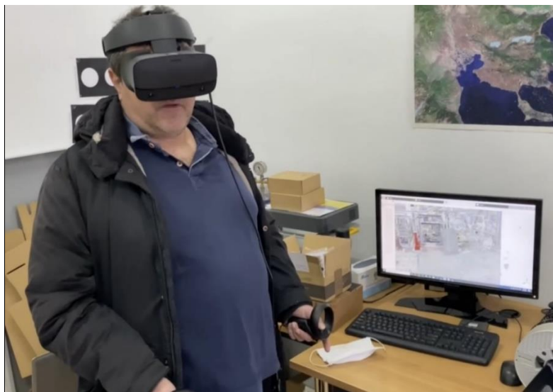
Figure 4. Virtual reality with Oculus Rift S during the survey of a compressor

In this study, the 3D point cloud of each survey has been extracted to a specific e57 format file, a compatible format for FARO SCENE lite viewer. Then, each derived point cloud was then transformed into a compatible virtual reality scene (see Figure 4), using the previously mentioned software package. Finally, the user can interact with each 3D object using the oculus Rift controllers and collect valuable asset information.