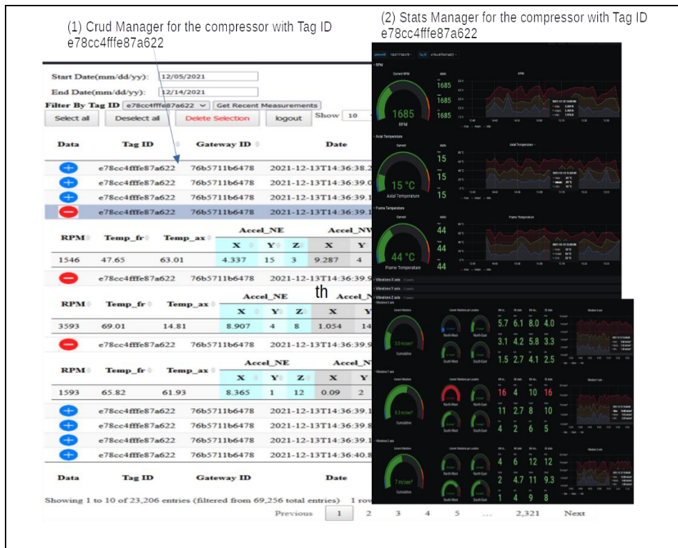
Figure 6. Compressor sensory component Stats Manager and CRUD Manager output.

An important piece in this intelligent and predictive maintenance architecture is the decision support system for maintenance technicians during maintenance interventions. This smart decision support system, called IAgent, articulated with human-machine interaction technologies, e.g. augmented reality, contributes to a faster and more efficient reaction and recovery of the failure occurs when compared to paper procedures. Its core functionality is the deprivation of critical assets malfunctions by providing prior information using a per asset sensory equipped part predictions of probable malfunctions.