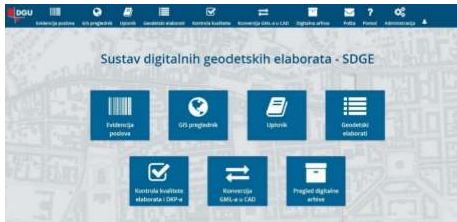
Figure 1 Initial GUI of SDGE service

SDGE is an application solution based on Web technologies, in order to be available via the Internet to all authorized surveying contractors using the basic Web browser. The system is owned by the State Geodetic Administration and developed by IGEA Ltd. The main purpose of the SDGE application solution is to provide a quality tool for digital geodetic elaborates that supports the entire process from downloading official digital data, preparation and production of geodetic studies to submission of digital studies to review and confirmation. SDGE consists of several modules (see Figure 1).