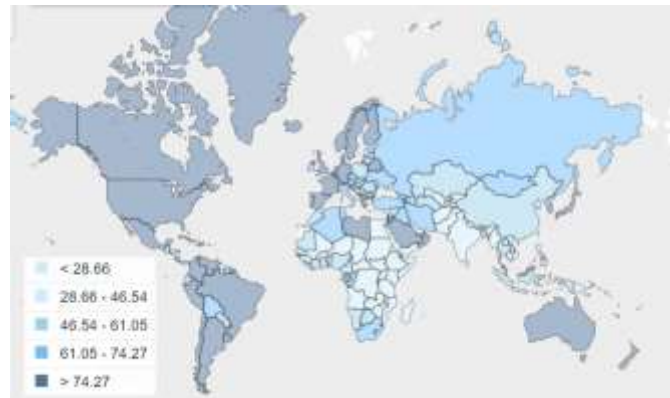
Figure 1: Urban Population (% of total) (World Bank 2018)

The population living in the city is increasing around the world. According to the United Nations, 66% of the world's population will live in urban areas by 2050 (United Nations, 2015). Nowadays all countries have people living in the urban areas (Figure 1). The human have some basic needs such as food, housing etc. but modern people who live in urban area have a lot of needs such as clean food, clean water, energy, transport, communication, comfortable residential area and other common services like security, education, health etc. The governments have to provide all needs of the citizens which mentioned above.