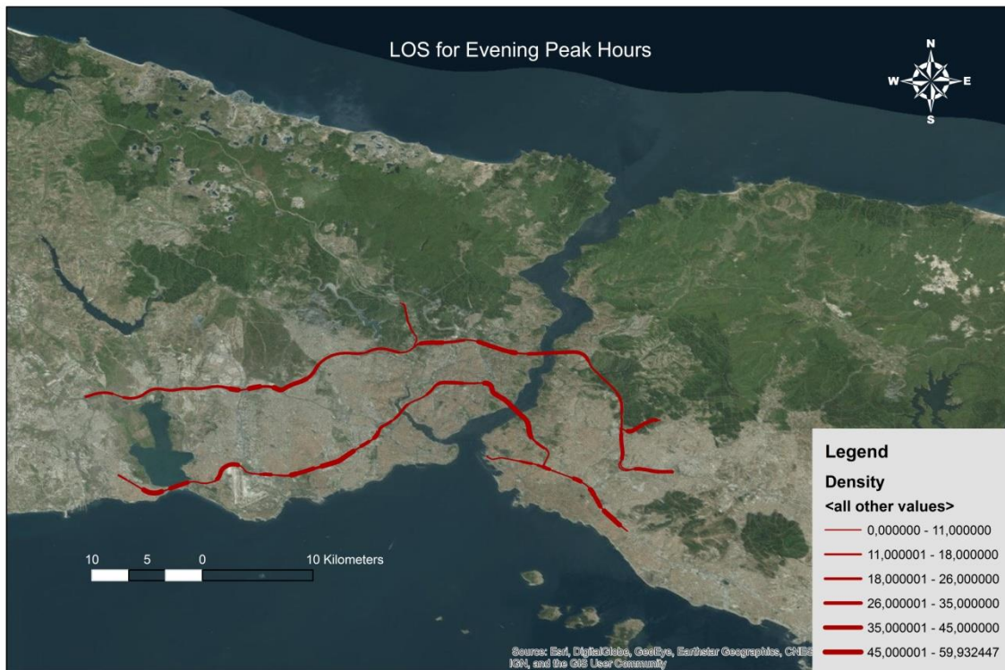
Figure 7. Level of Service for Evening Peak Hours