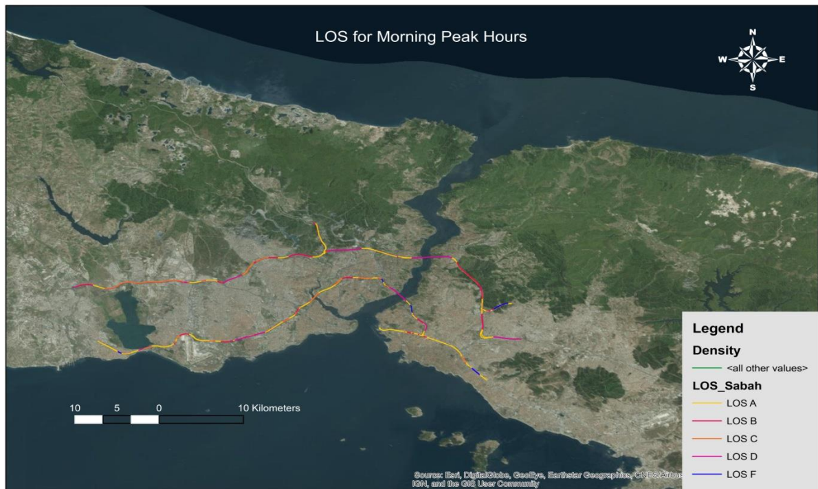
Figure 6. Level of Service for Morning Peak Hours

Level of Service for each segments of road at Evening peak Hours can easily be understood by using different size marker symbols as indicated Figure 4.