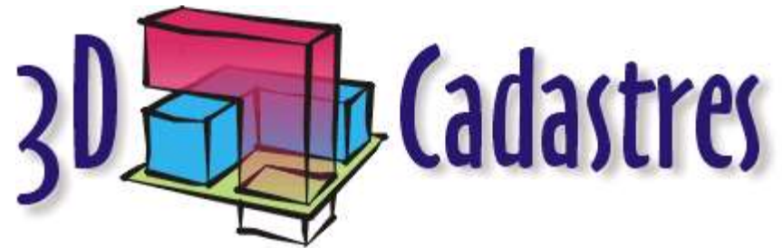
FIG 3D Cadastres working group (joint commission 3 and 7 activity)