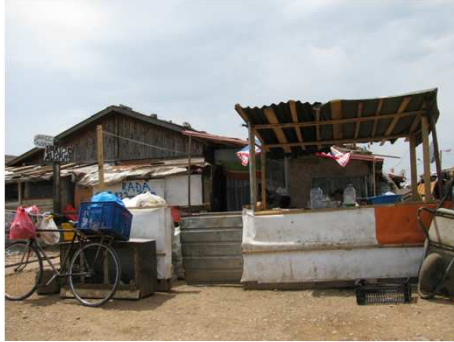
FIG WORKING WEEK 2015 17-21 MAY SOFIA BULGARIA

"From the wisdom of the ages to the challenges of modern world"