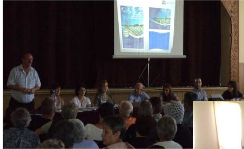
FIG WORKING WEEK 2015 17-21 MAY SOFIA BULGARIA

"From the wisdom of the ages to the challenges of modern world"