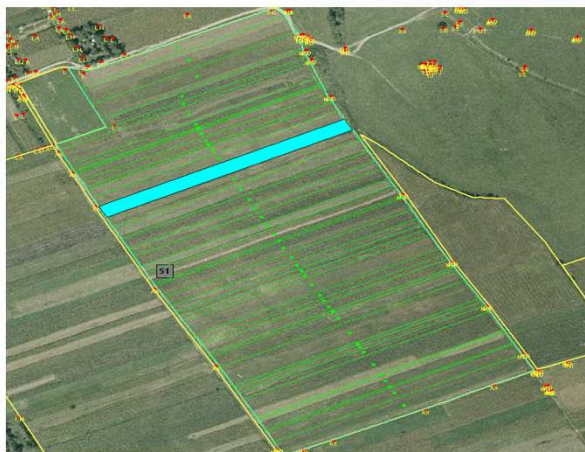
FIG WORKING WEEK 2015 17-21 MAY SOFIA BULGARIA

"From the wisdom of the ages to the challenges of modern world"