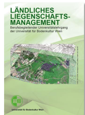
Figure 2: Information folder of the study course (page A1)