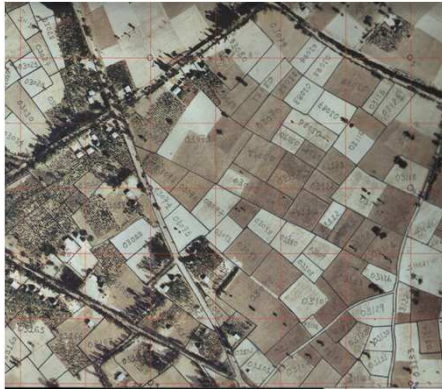
Orthophoto used as a field work map sheet with a georeferenced grid. The map shows the delineated parcel boundaries and parcel identification numbers.