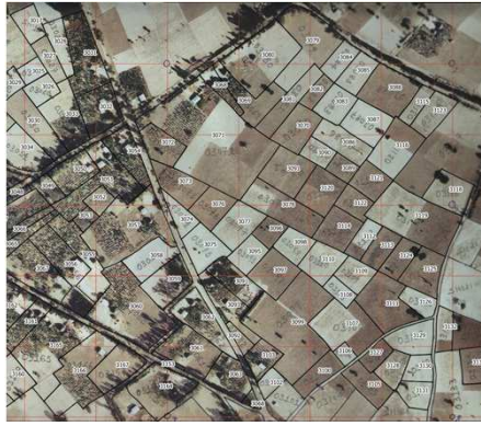
Vectorised field map showing the resulting cadastral map with parcel boundaries and cadastral numbers.