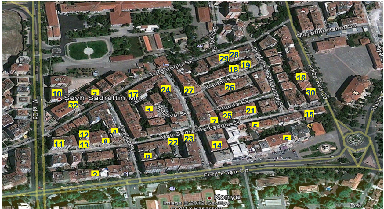
Map 3: Map Of Housing To Compare

We can calculate the annual net rental value ( D_{knet} ) by using this data as follows: