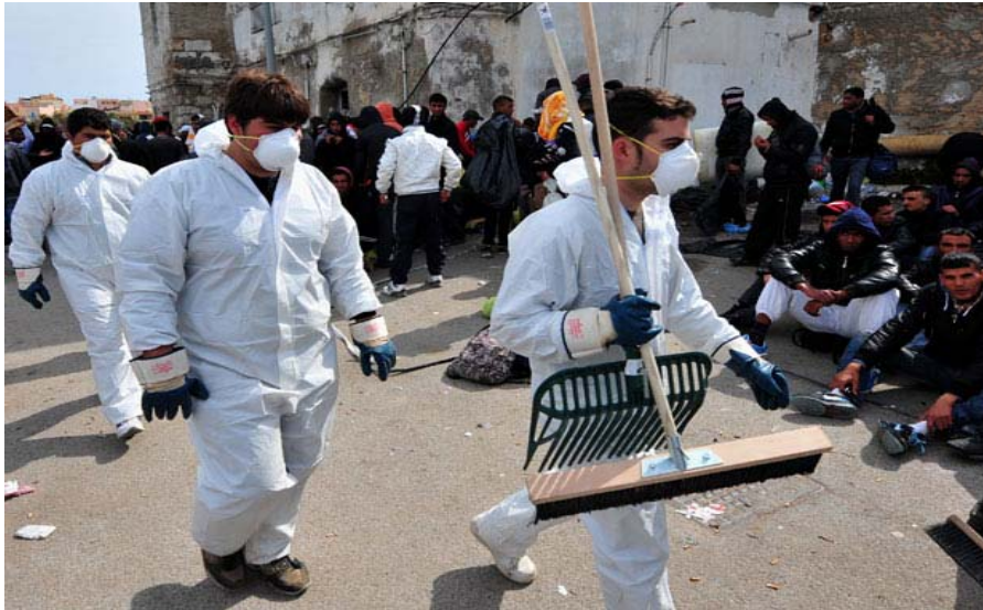
(Photo 1. Immigrants from Tunisia and Libya have arrived on the island Lampedusa, March, 2011)

** - Among countries which “were founded” by emigrants like Australia, Canada, USA only Canada was able to create a multicultural society by integrating people of different origins, which, however, preserve their cultural heritage. While the U.S. has already built up a huge wall at the border with Mexico in order to stop millions of illegal immigrants. Some of the countries from EU try to do the same as long as EU became very attractive for Africans and majority of Asians even though for some of those who have reached the EU and haven’t been lost on his way the life in Europe often became a nightmare.