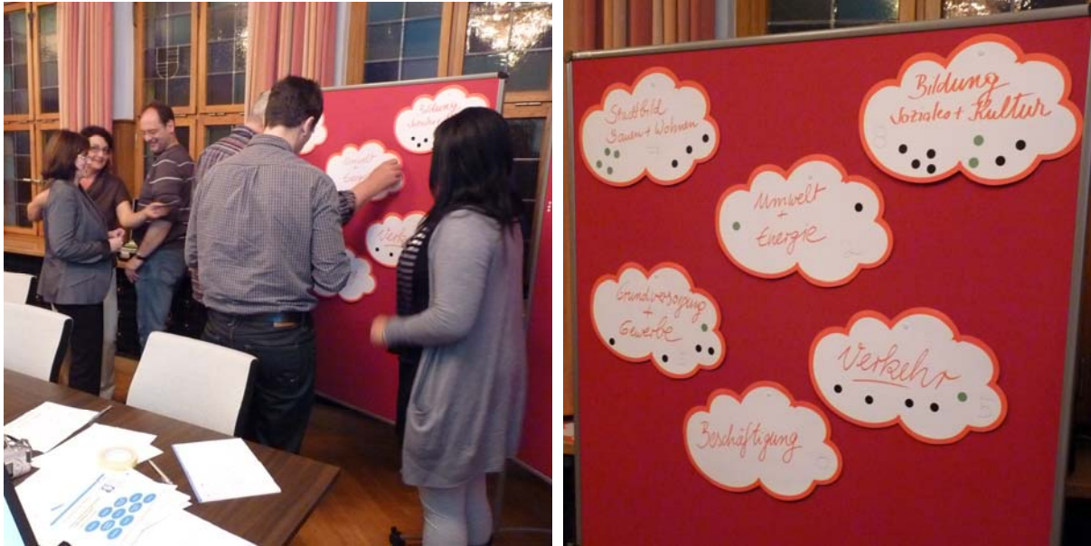
Images 3 and 4: Impressions from a workshop in the city of UHINGEN (Source: die STEG Stadtentwicklung GmbH).

On the political side awareness for the need for substantial participation processes is occasionally missing, because decision-makers (sometimes even the urban administration) fear a limitation of their powers. The formerly familiar assertion “What are citizens good for in planning-processes? Nothing. They lack expert knowledge.” (Selle 2006, p. 497) still serves as an (unspoken) excuse in limiting the scope of action for citizens. After all, the town council consists of elected representatives.