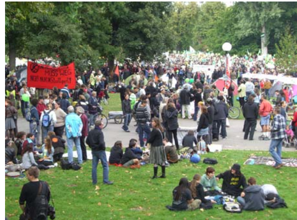
Images 1 and 2: Types of Public Protest against the Railway Project Stuttgart 21.