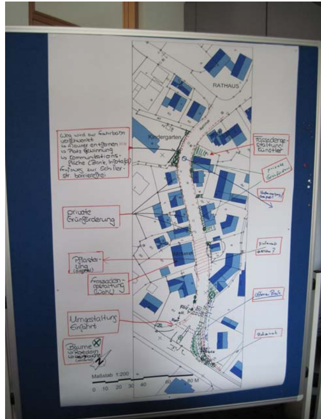
Images 5 and 6: Results of a Workshop in the local authority Birenbach.

The multitude of factors of success and quality criteria respectively shows that participation processes in civil society in line with urban development and urban renewal are highly sophisticated and innovative procedures. Participation processes do not end in themselves, they fulfill a vital function in local democracy and therefore have to be conducted to a high standard to warrant the expended resources and to achieve the desired outcome (cf. http://www.buergergesellschaft.de ). Nevertheless there is no best solution for all cities and communities to attain optimal public participation, the different particular basic conditions of cities dictate the development of a participation concept on a case-by-case basis.