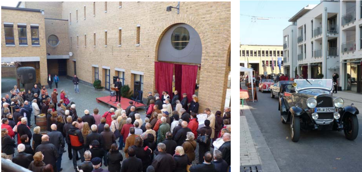
Image 7: The mayor of the city of Fellbach and interested citizens during a road inauguration ceremony (Source: die STEG Stadtentwicklung GmbH).

In summary it can be put on record that in course of public participation processes in Germany, there is still a lot of demand for reform. Dietrich formulated it in the Frankfurter Allgemeine Zeitung on the 21.10.2010 as following: "A lively democracy is in itself a continuous construction site. From time to time not only the foundation has to be changed, but also the tools of will-formation. This hasn't happened here in a while." There is nothing more to add to this conclusion!