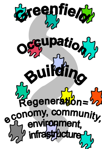
Topsy Turvy Development

Where orderly development equates to a cycle that starts: