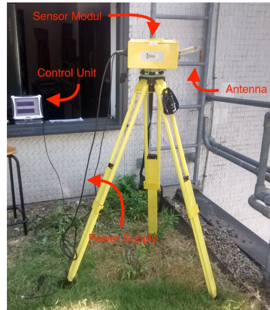
Figure 1. IBIS-S measurement unit installed on a topographic tripod.

IBIS-S sensor can locate and simultaneously track a set of targets in the portion of space illuminated by the radar signal. However, only one target can be detected inside each 'range bin,' which is the volume of the radar wavefront included between distances R and R+\Delta R from the sensor (see Fig. 2), with \Delta R the range resolution that is independent from range R . This involves that, if a highly-reflecting element is predominant inside a single range bin, this feature will be effectively tracked within time. But in the case two or more reflectors are inside the same range bin, they cannot be discriminated.