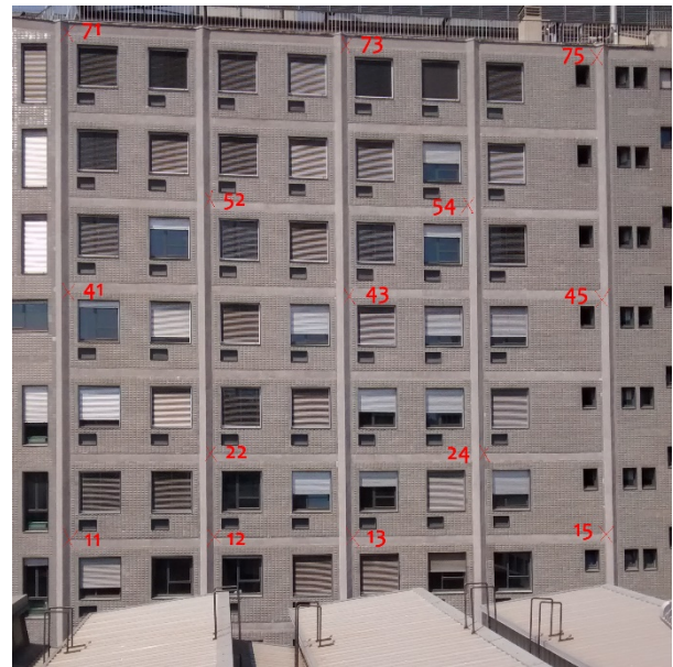
Figure 3. The façade of Politecnico di Milano (Leonardo Campus) building selected for preliminary experimentation of 'stereo-radar' monitoring. Red numbers refer to points measured using a total station.

The experimentation of the 'stereo-radar' technique has been conducted to measure deformations of a seven-floor building of Politecnico Milano, Leonardo Campus (Italy), see Figure 3. Three stations have been set up on the roofs of two other buildings in the nearby. On each station a measurement session of 25 min has been carried out using a 10 s sampling rate. The maximum acquisition distance has been set up to 75 m. Environmental parameters have been also recorded during the measurement sessions using a meteorological station located within 50 m from the area of operations. Since only one IBIS-S instrument was available, the aim of this experiment has not been to accomplish a real 'stereo-radar' measurement. However, since short elapsed times separated the GBRAR measurement sessions and the building deformations were supposed to be slow and small, the aim of this experiment was to detect whether the same natural targets could be tracked from different positions.