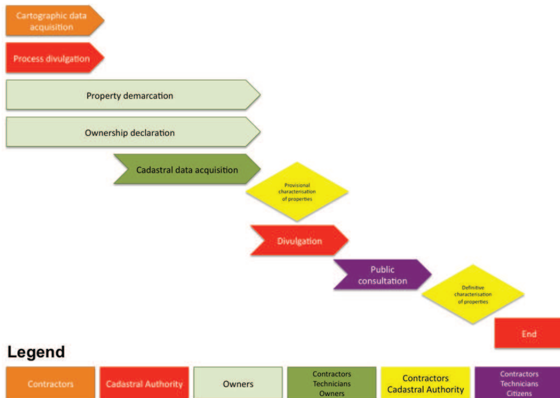
Figure 1. Overview of the different stages of the cadastral process and respective interveners (After IGP 2009)

In the official documentation above, seven chapters are devoted to the different sorts of data to be acquired, methods, and also accuracy and precision requirements. We reviewed in more detail Chapter E of IGP’s document (on Data Structure & Content) and Chapter M (Cartographic Data) directly related to the different sorts of data involved in the process, and thus aspects into which VGI may potentially contribute to. In Chapter E, 24 different “Cadastral Entities” are identified and described in terms of their alphanumeric attributes. These entities are grouped into 7 “Types of Entities” (see Table 2 below).