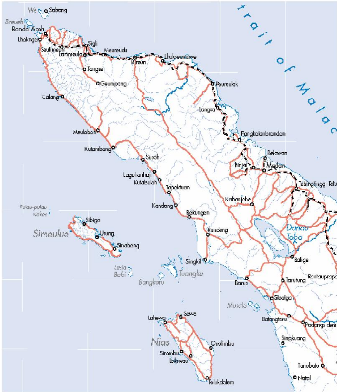
Map 1. Geographical Extent of the Disaster-Affected Areas