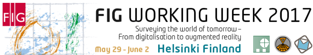
FIG Working Week 2017 will take place in Helsinki, Finland 29 May – 2 June 2017 at Messukeskus Expo and Convention Centre.