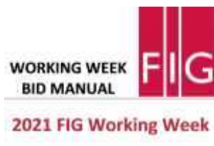
FIG Working Week 2021 - Call for Bids – Deadline 15 December 2016

Do you want the 2021 Working Week to take place in your country with your association as the local host? FIG invites all Member Associations to consider making a bid to host the prestigious FIG Working Week 2021 together with the Federation. The Council has prepared bidding guidelines for the Working Week.