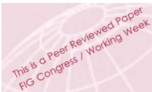
FIG introduces the FIG Peer Review Journal which includes a collection of all papers from FIG Congresses and Working Weeks that have passed the double blinded peer review process.

http://www.fig.net/news/news_2016/2016_11_peer_review_journal.asp