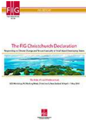
FIG is proud to launch the latest publication in the FIG Publication series: The FIG Christchurch Declaration - Responding to Climate Change and Tenure Insecurity in Small Island Developing States - The Role of Land Professionals.