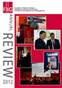
FIG Annual Review 2012 and FIG Profile

The FIG Annual Review 2012 is now available as .pdf. Hard copies will be mailed to all members together with the minutes from the General Assembly in Abuja, Nigeria 2013. Also FIG Profile has been updated. You can download the FIG Annual Review and profile here: