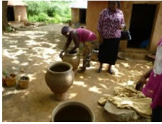
Visiting a traditional pottery