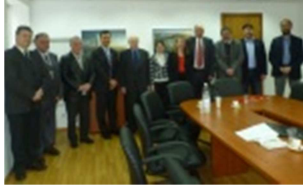
The local organising committee

"From the wisdom of the ages to the challenges of the modern world". Read about the background for choosing the theme of the Working Week 2015. At the FIG General Assembly in Rome 2012, Bulgaria was elected to be the host of the Working week 2015, and the preparation already started in June 2012. The local organizing committee is already working intensely on the preparations. FIG visited Sofia to discuss and work on the preparations.