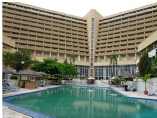
Nicon Luxury Hotel – the conference hotel and partly venue together with the International Conference Center

https://www.fig.net/registrations/regform.asp?eventid=95