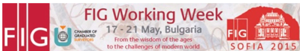
FIG Working Week 2015, Sofia, Bulgaria - preparatory meeting 26-28 February 2013