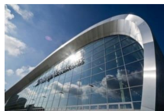
Messukeskus – the conference venue

Have you registered for FIG Working Week 2017 that will take place in Helsinki, Finland 29 May – 2 June 2017 at Messukeskus Expo and Convention Centre?