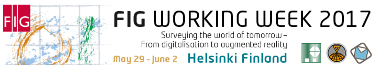
FIG WORKING WEEK 2017 – HELSINKI, FINLAND - PROGRAMME AT A GLANCE

Have you registered for FIG Working Week 2017 that will take place in Helsinki, Finland 29 May – 2 June 2017 at Messukeskus Expo and Convention Centre?