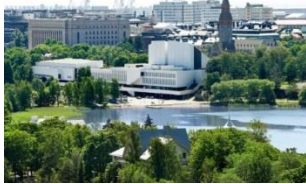
The famous Finlandia hall is venue for the Gala Dinner