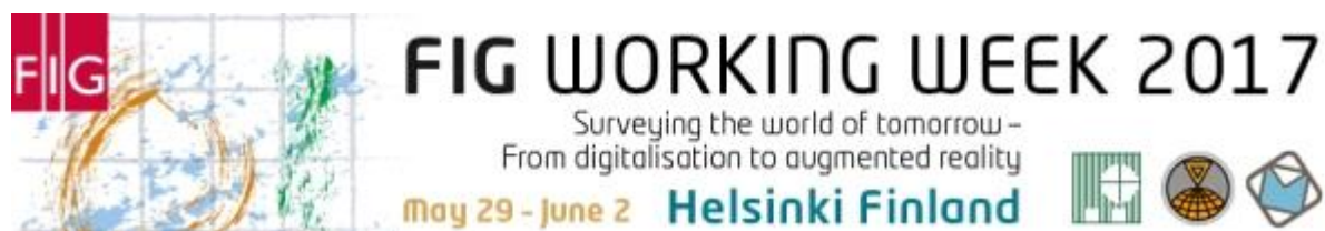
FIG Working Week and General Assembly.