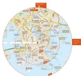
The city of Helsinki

On Sunday 28 May conference days you have the opportunity to choose between three different pre-events: