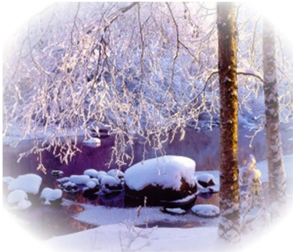
FIG Office wishes you:

Welcome to the FIG e-Newsletter, which brings you latest information about FIG and its activities. The information referred here is in full length available on the FIG web site. Thus the e-Newsletter is produced to inform you what has happened recently and what interesting things are going to take place in the near future. The FIG e-Newsletter is circulated monthly or bi-monthly by e-mail. The referred articles are in English and written in a way that you are able to extract them to your national newsletters or circulate to your members and networks.