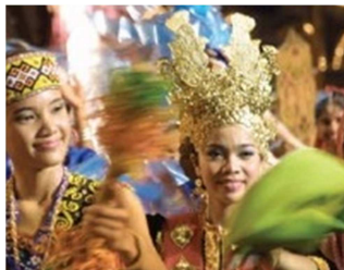
Experience the Malaysian culture at the social events

A fully packed program will be offered. The Congress will showcase the work of FIG and its Commissions, Task Forces and Permanent Institutions. The program will be underpinned by invited high level key note speakers in four plenary sessions. The four consecutive congress days will be offering up to 10 parallel sessions and workshops. In addition a range of technical tours will be offered aimed at highlighting the role of the profession in Malaysia and set across the broad context of FIG's Commissions. And did we mention the Malaysian evening and Gala dinner?