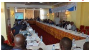
Commission 7 Annual meeting in Yaoundé, Cameroon

A series of events was held in the Djeuga Palace hotel in Yaounde, the capital of Cameroon in October 2013: