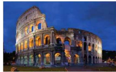
The Colosseum, Rome.