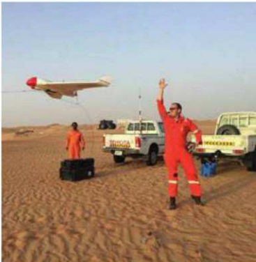
The survey consisted entirely of sand dunes.

measured temperatures in the sun of up to 68 degrees Celsius, this must be one of the hottest UAV surveys ever conducted.