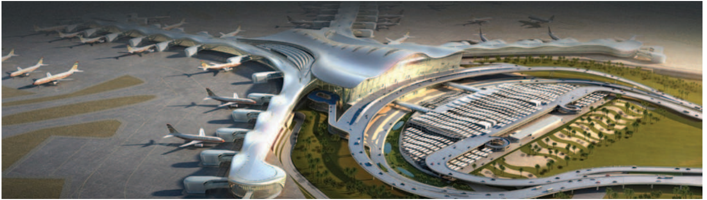
Bentley users at Abu Dhabi Midfield Terminal Building have adopted BIM processes

and delivering efficiency savings by being more open and collaborative.