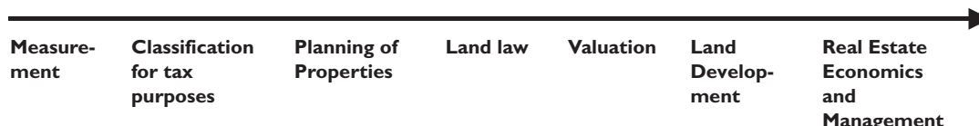
FIGURE 1. HISTORIC EVOLUTION OF SWEDISH LAND SURVEYOR COMPETENCE.

In a number of countries, land surveyor education programmes have been diversified to such an extent that two or three main specialities have been created. This is true of Norway and Finland, both of which have two main specialities, and of Sweden and Denmark, which have three. These main specialities are identified in Fig. 2, since they provide interesting aspects of education and profession. The Danish planning speciality, however,