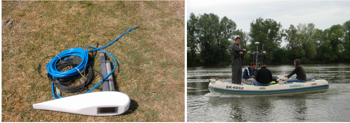
Figure 1. Multibeam echosounder and a vessel on which the system was installed

Due to strong currents and sandy composition of soil, water was muddy and full of particles that directly affect the accuracy of the beam and data filtering. Specifically, in the data filtering process it is necessary to distinguish the noise from real data.