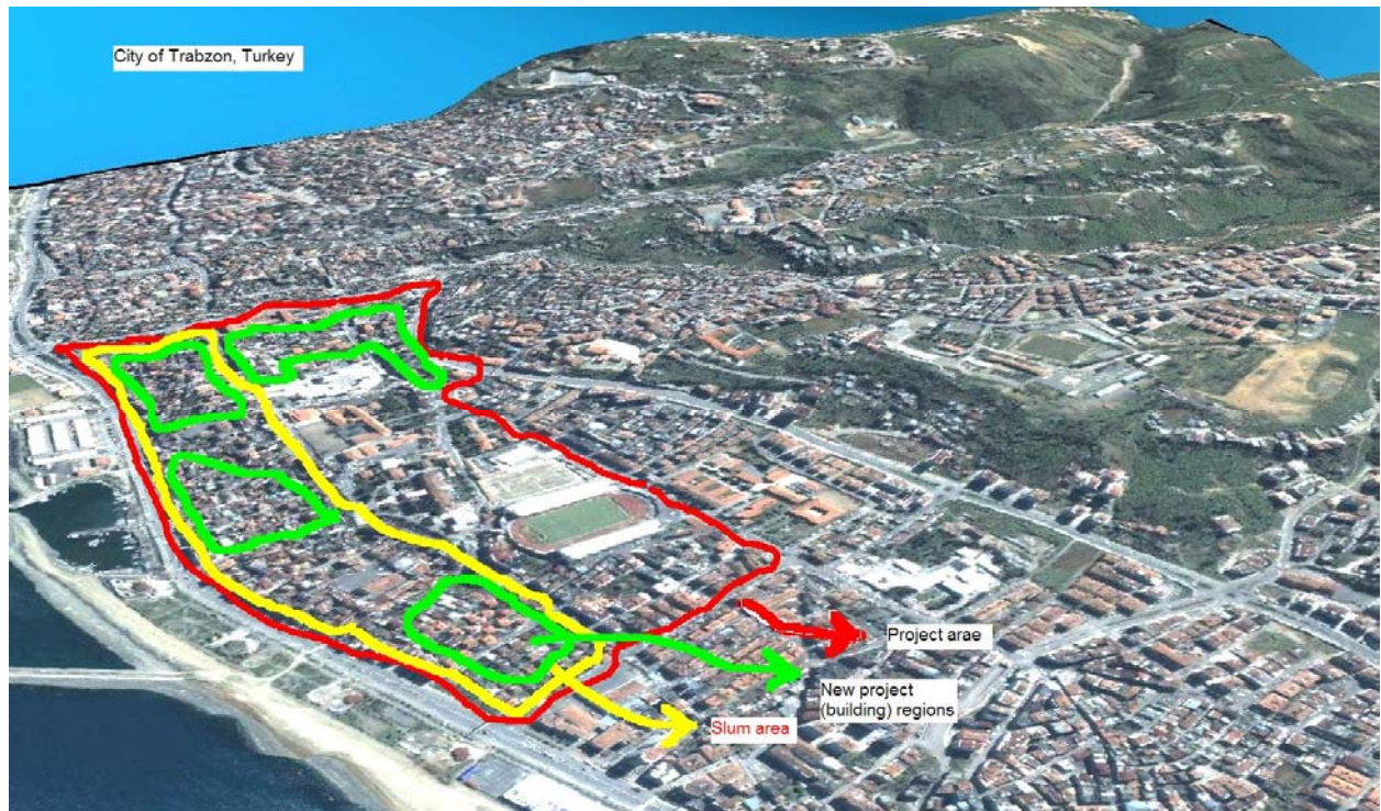
Figure.2 A View of Project Area (almost 600.000 m 2 )

In the planning area, a 30% of the total land is allocated for public areas such as roads, green areas and parks etc, while 15% of the total land is allocated as reserved land that will be sold to cover project operating expenses. And rest of the land will be given back to current land holders and slum landowners too. The main point here is that in the planned area extra new buildings with more number of flats should be available to give back to land owners. In land distribution process, rather than area distribution, a nominal value based distribution is applied.